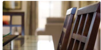
AREAS AND OVERALL SIZE