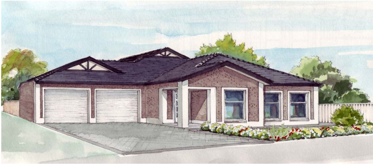
Elevation for illustration purposes only