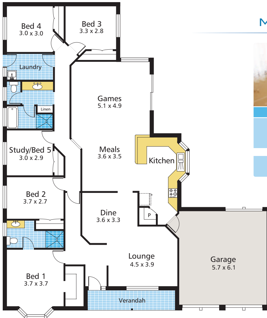
MCLAREN 5 (201) ©