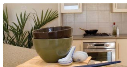
AREAS AND OVERALL SIZE